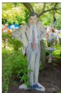
Look ... it's Mr. Bean!