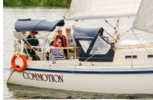
The fun-filled day ended with a potluck happy hour and a BBQ