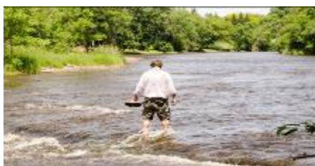
A visitor taking advantage of a refreshing dip