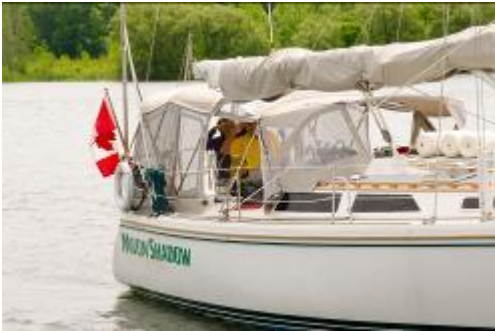
wares for the Locker Sale were displayed.