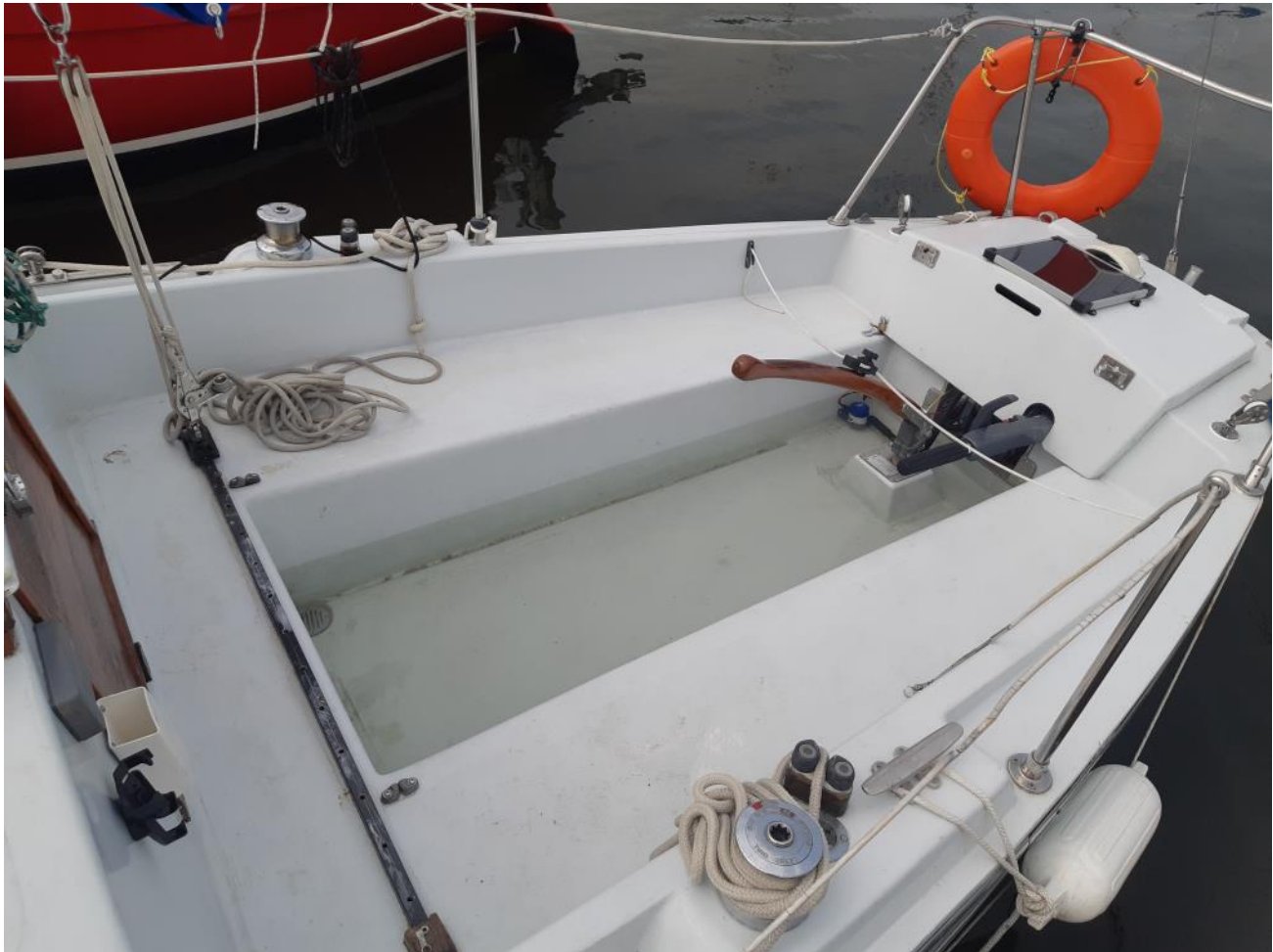
Private swimming pool at the Marina

"emphasizing the sensuous or sensational aspects of a nonsexual subject and stimulating a compulsive interest in their audience"