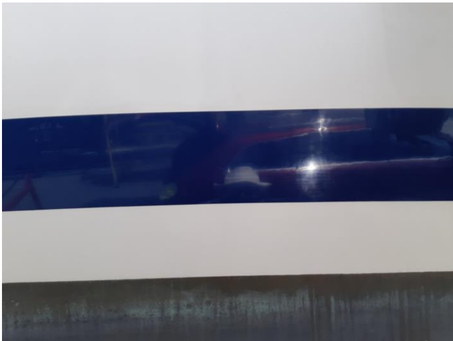
Neglected Girl is Gets Her Luster Back