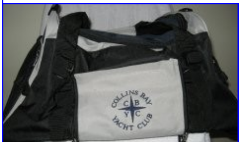
Day Bags - Navy and Cream: $25.00

As you are aware there are many other items available through Multideas. For those members outside the Kingston area who wish to order items from Multideas I would be happy to pick up the items for you during the week. All you have to do is ask Barbara Ledain to call me when your items are ready.