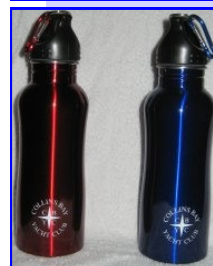
Water Bottles - $10

The fleet was divided between the marina and the DEC docks but this split did not deter the enthusiastic Happy Hour devotees among us as we celebrated the day (and days past) at the picnic tables on the DEC grounds. A good time was had by all!