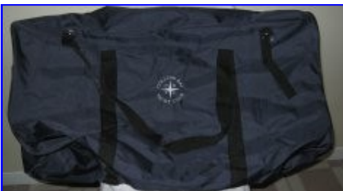
Large Duffle Bag: $10.00