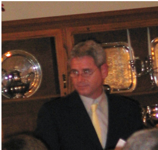
The Vice Commodore addressing the masses.

We then went back to the drawing room for the racing/cruising awards with Paul again as our emcee.