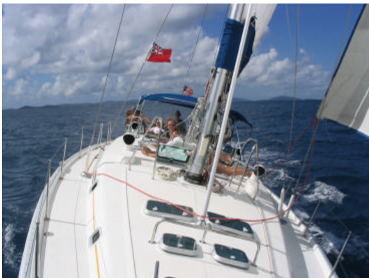
Heading east from Jost Van Dyke