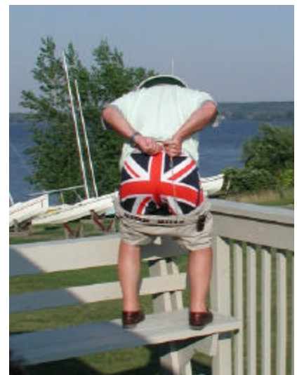
Butt who is it?

P.S. The dinghy is still lashed to the deck at D15.