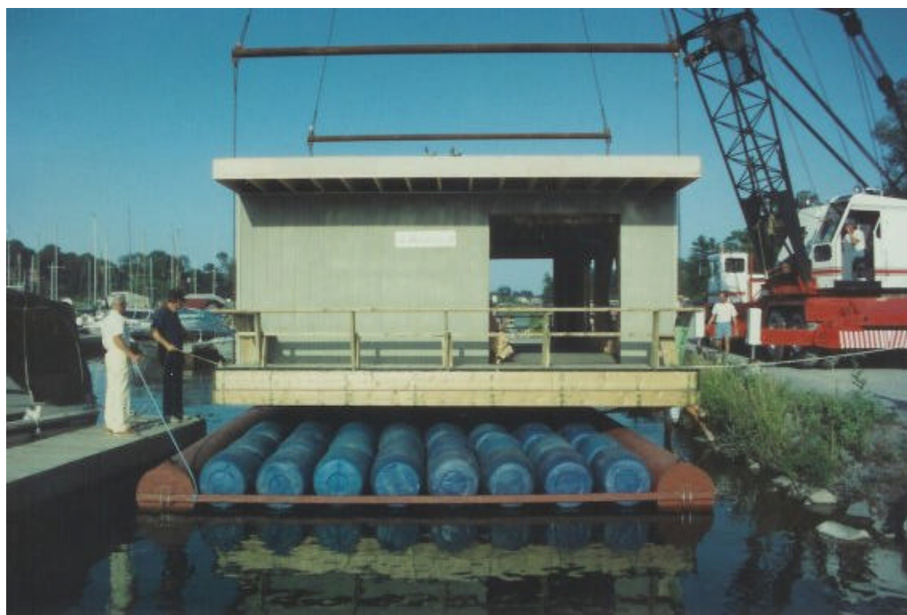
Launching of the CBYC Clubhouse S.S. Maria August 1992