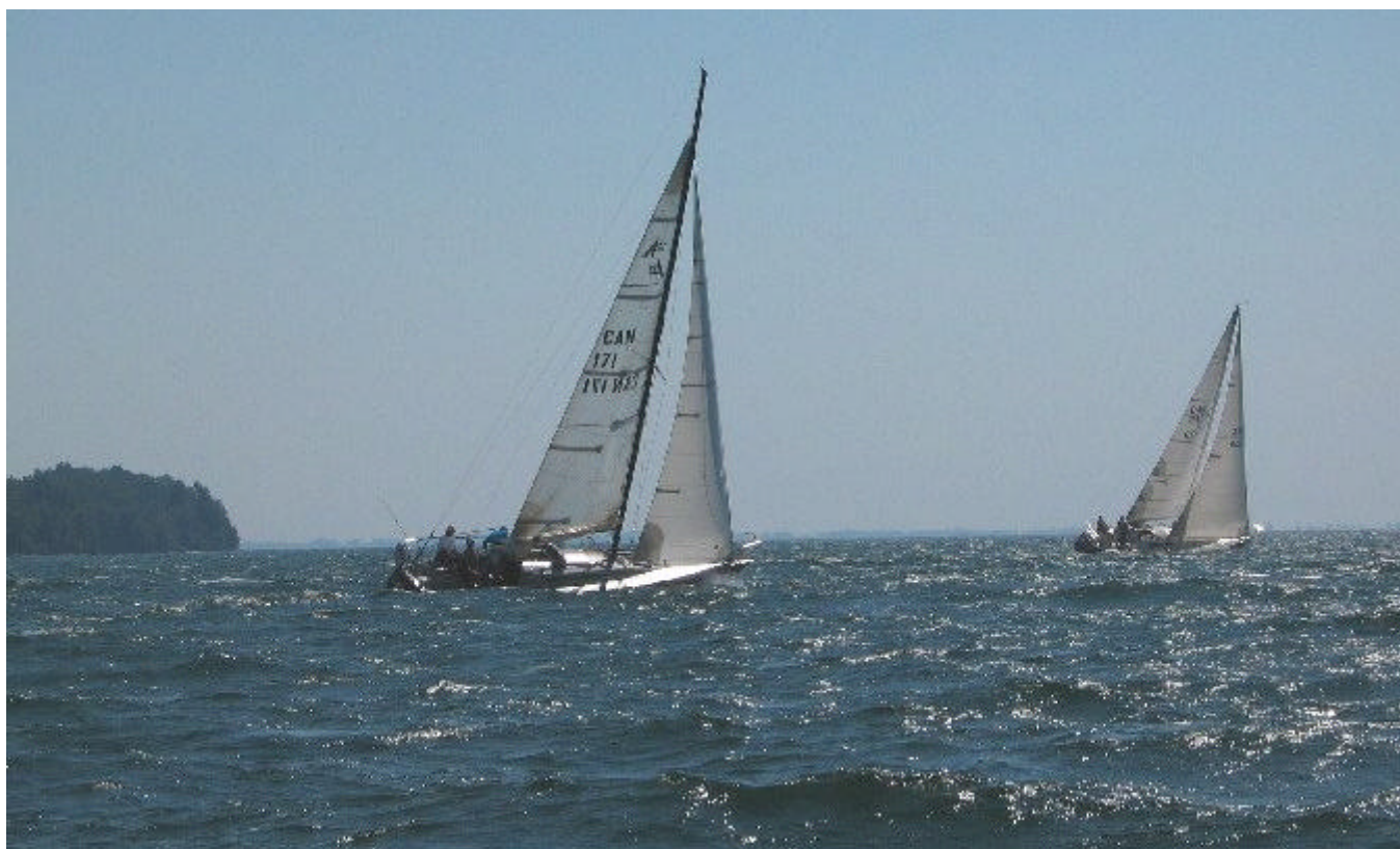
CBYC 25th Anniversary Regatta