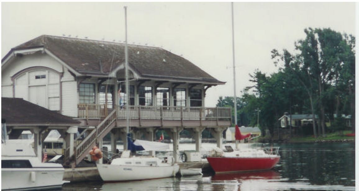
Thousand Islands Golf Cruise, Wellesley Island, August 3-5, 1991 (Bill Worthy)