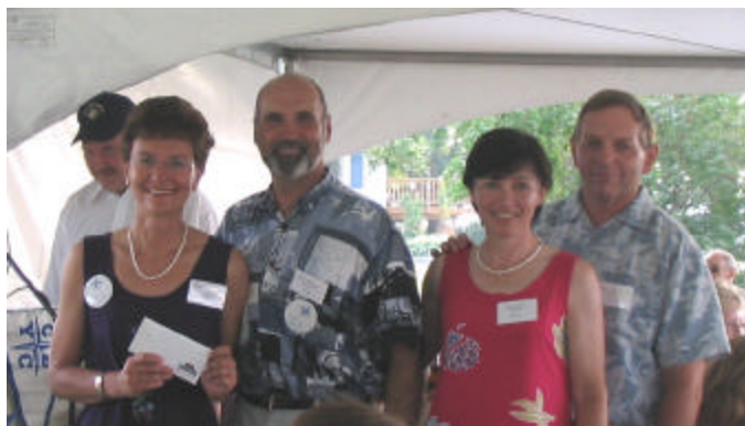
Dinghy Challenge Regatta winners