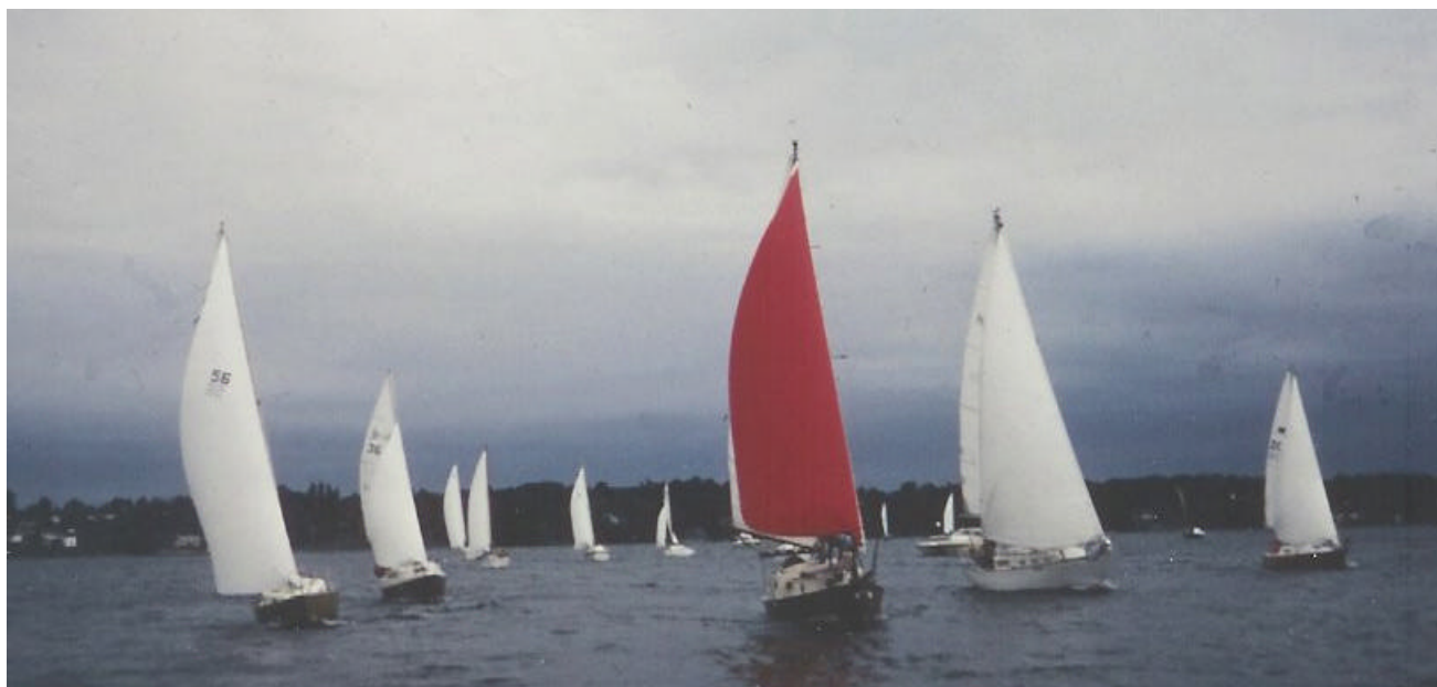
The first CBYC Pigeon Island Race, September 13, 1980. 37 boats registered. (Judy Adams)