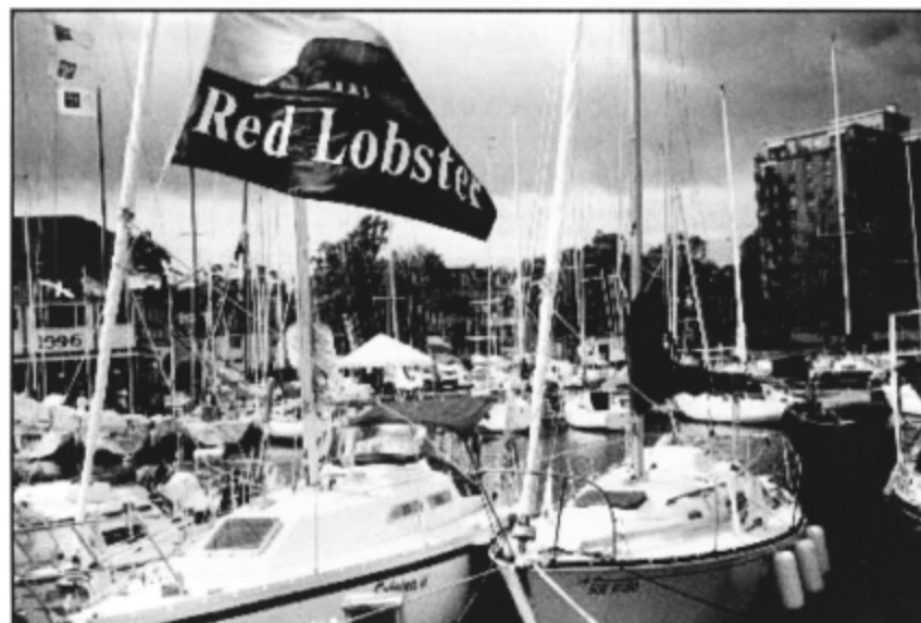
Sabrina IV and Stardust IV