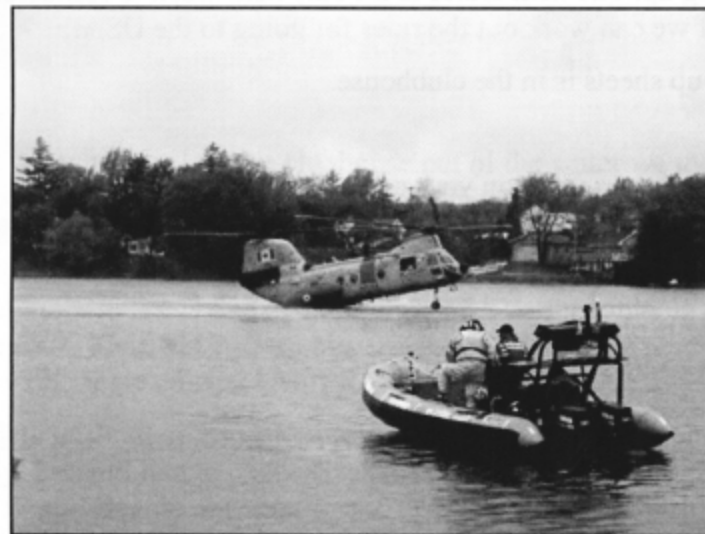
Safe boating demonstration (May 24th)