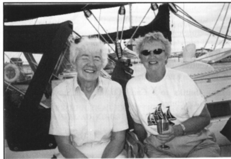
Happy hour on the Fish & Chips Cruise