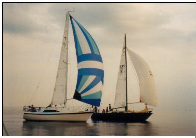
Be R Guest overtakes Black Knight in summer series

If you are interested in racing your boat or you would like to crew in the distance races or the Thursday Night Series and would like more information contact Malcolm Stott.