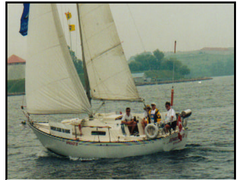
Stardust IV at Easter seals Regatta