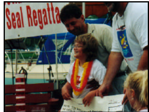
The Smile on this face is what it is all about! Join us next year! You won't be sorry!