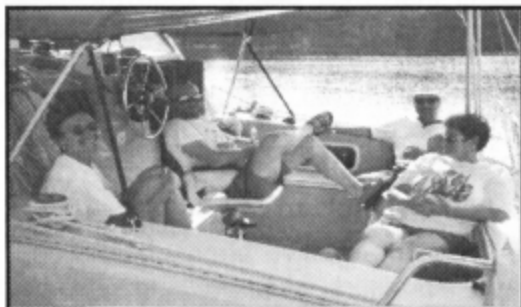
Happy Birthday Neill!