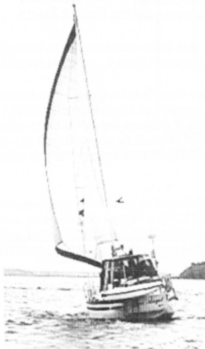
Blue Angel heading out of St Helen