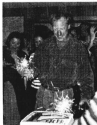
Happy Birthday Hub! - at the wine and cheese party