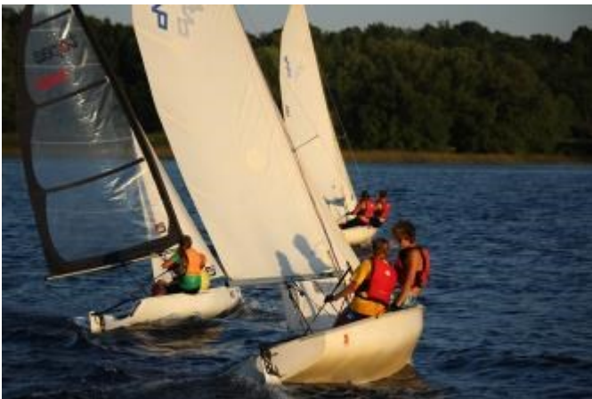
Photo – last dinghy race of the year 26 August

Speaking of enrollment, anyone planning to enroll a child in an organized fitness program for the first time in 2017 should be aware that the $500 federal children's fitness tax credit is being eliminated after 2016. If your child is was not enrolled in an eligible program in 2016, you may still be able to take advantage of this tax credit for an eligible program in 2017, as long as the registration fee is paid before the end of December. If anyone would like to apply this to sailing school registration for summer 2017 please contact me.