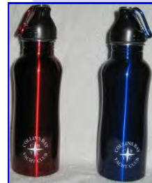
Water Bottles - $10