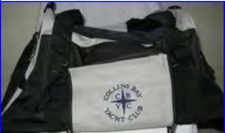
Day Bags - Navy and Cream: $25.00

As you are aware there are many other items available through Multideas. For those members outside the Kingston area who wish to order items from Multideas I would be happy to pick up the items for you during the week. All you have to do is ask Barbara Ledain to call me when your items are ready.