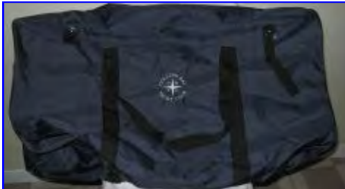
Large Duffle Bag: $10.00